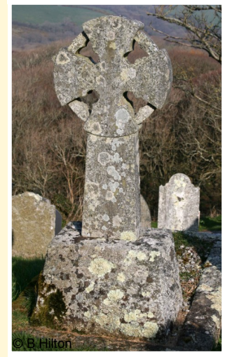
Granite Celtic cross with leafy and crustose lichens

For further information see the BLS website www.britishlichensociety.org.uk or write to the BLS, c/o Dept of Botany, Natural History Museum, Cromwell Rd, London SW7 5BD