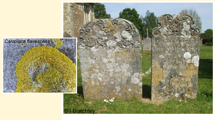
Limestone headstones with yellow-orange crustose lichens

A church and its graveyard provide undisturbed surfaces on which lichens can grow, especially on stone. Remarkably, over one third of the 2000 species of lichens that occur in Britain and Ireland are found in churchyards!