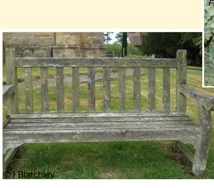
Trees and seats often have leafy lichens