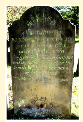
Psilolechia lucida picks out the letters on a sandstone headstone